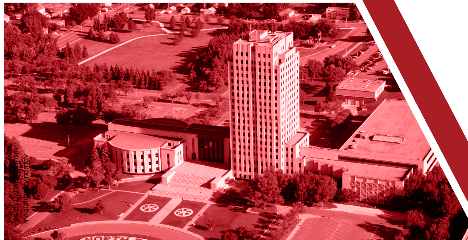
North Dakota Journalism mediainfo@nd.gov